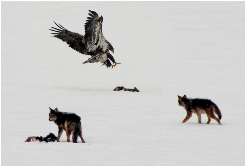
Eagles Scavenge from Coyotes on Newfound Lake, January 2009

E D U C A T I O N • C O N S E R V A T I O N • S T E W A R D S H I P