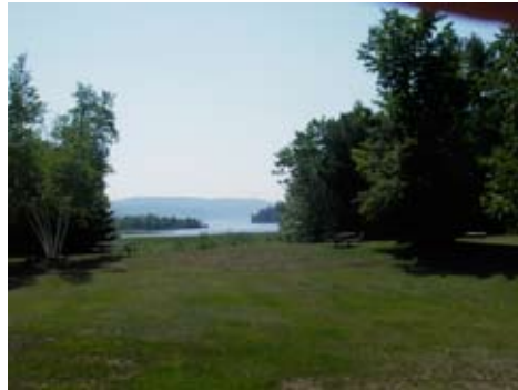
The view overlooking Hebron Marsh, site of the Naturally Newfound Fair, June 27