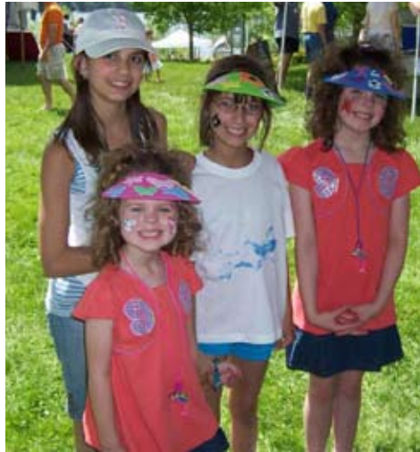
Face-painting, Naturally Newfound Fair