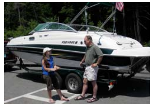
Lake hosts help prevent invasive plants from coming to Newfound.

The cost of managing a lake or pond with an exotic weed infestation quickly becomes an extremely expensive problem for local municipalities or associations. Keeping ponds and lakes free from exotic species helps protect our quality of life and economy in New Hampshire!